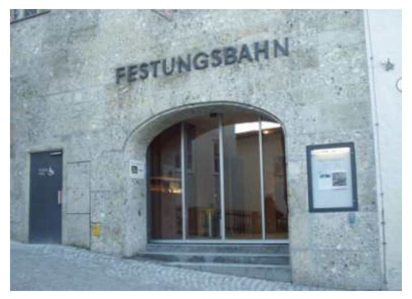
Elevator to the fortress