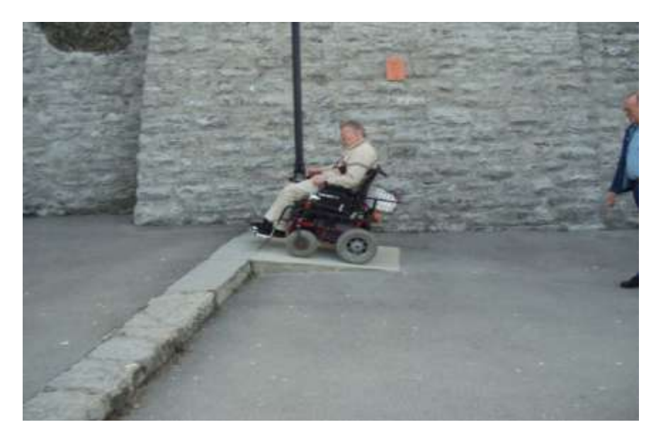
View point at the fortress