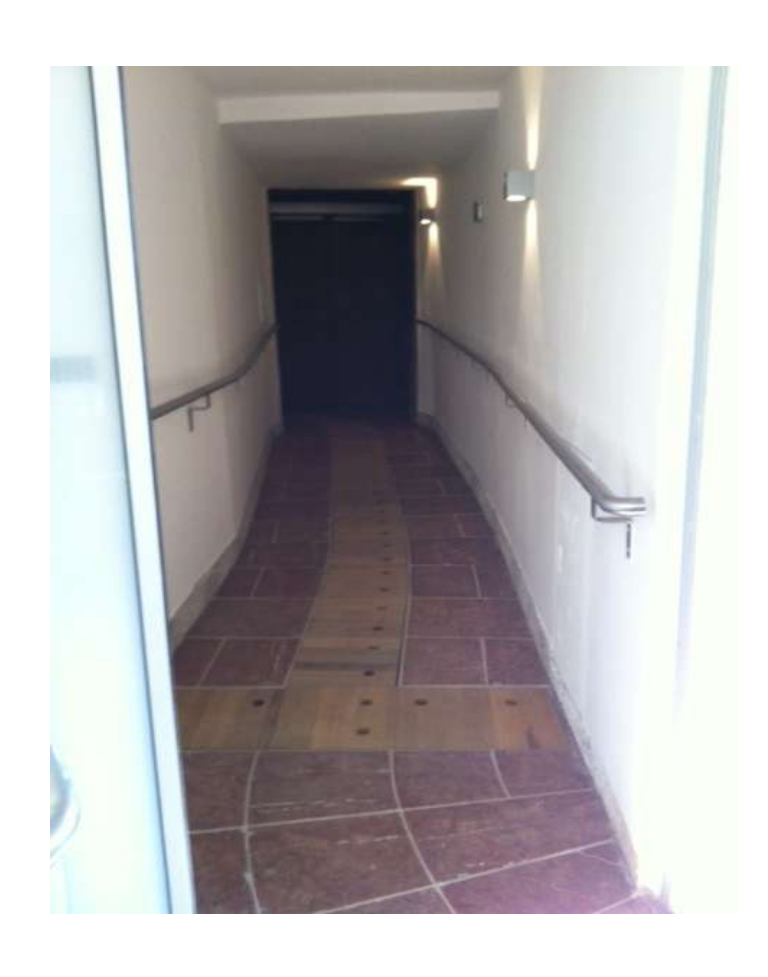
University Church/Historic City