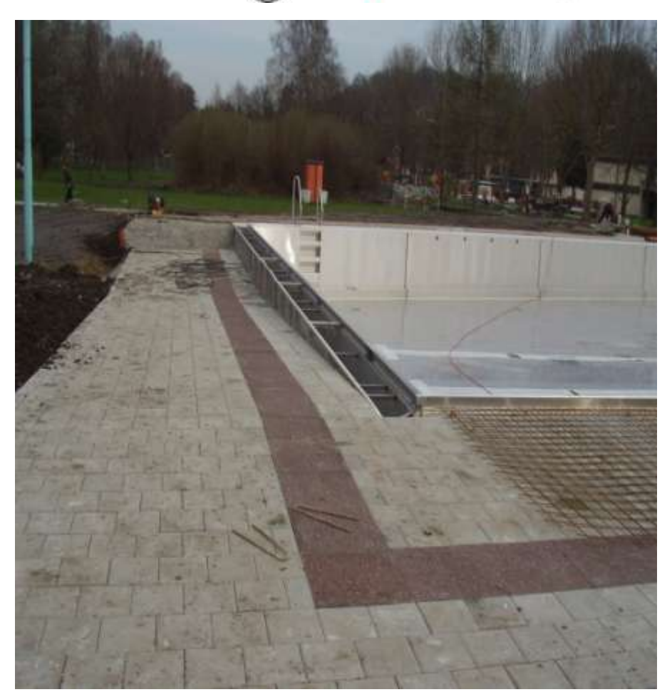
Outdoor swimming pool Leopoldskron